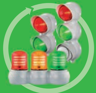
SIGNALS & BASES